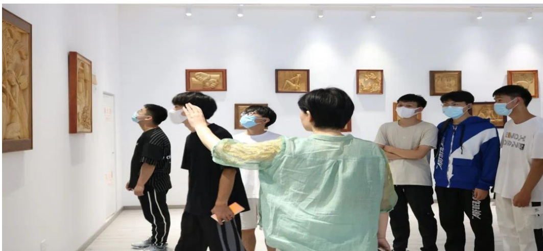
Figure 4. The wood carving professional teacher leads the students to appreciate the charm of Dongyang wood carving intangible cultural heritage

At the same time, the use of Dongyang's diversified wood carving art resources, such as: Lu House, Master of arts and crafts studio, Dongyang Wood Carving City cultural tourism area, Dongyang Wood carving Museum, Dongyang Wood carving town, etc., to carry out on-site teaching, fully tap the cultural attributes of intangible cultural heritage. Guangsha University simultaneously uses the "Wood carving skills inheritance Training Base" built by itself to periodically carry out wood carving intangible cultural heritage cultural activities, such as: "Welcome the 20th National Congress, science popularization to the future" series of science popularization activities of carved Liang painting Dong intangible cultural heritage wood carving, learning to inherit culture. It has enriched students' college life, made them better understand Dongyang Wood carving intangible cultural heritage culture, and learned to inherit Dongyang wood carving craft. During the National Science Popularization Day, the School of Art and Design and Design and Design and Design carried out the wood carving craft popularization activity of "Appreciating wood carving of intangible cultural heritage and learning to inherit culture", popularizing the charm of Dongyang wood carving to freshmen majoring in carving. Feel the charm of Dongyang wood carving intangible cultural heritage.