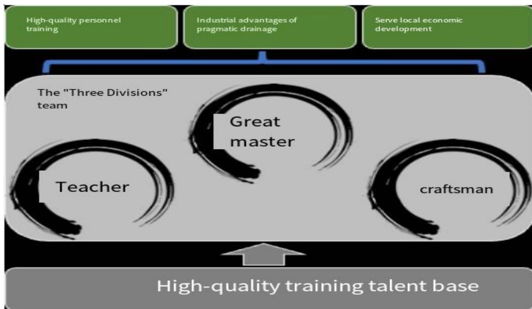
Figure 3. High-quality talent training structure of "three teachers" type team

3.2 Make use of Dongyang wood carving local industrial advantages to cultivate modern new talents In Dongyang City, Zhejiang Province, where Guangsha University is currently located, there are more than 1,300 enterprises engaged in Dongyang wood carving, including 47 enterprises, 13 leading backbone enterprises, 3 wood trading markets, 3 large furniture trading markets, and more than 100,000 employees. At the same time, the talents cultivated by colleges and universities are not like production line workers, and lack the heritage of cultivating master-level talents. Vocational